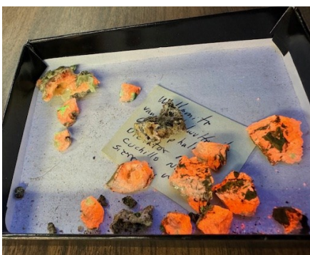
Willemite & Calcite Dictator Mine

Our next micro mineral meeting will be held Feb. 20th at the Monte Vista Christian Church, with a topic of "Heart-shaped Minerals." This will include the Japan Twin forms of crystals, so search your collection and show off your unusual specimens!