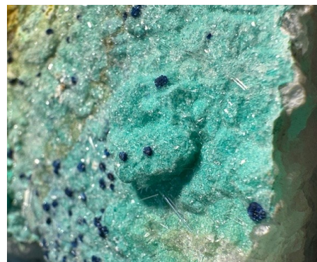
Selenite with Azurite nodules