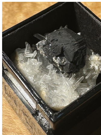
Chalcopyrite on Quartz